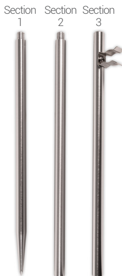
Figure 1. 3-Piece Microphone Stand