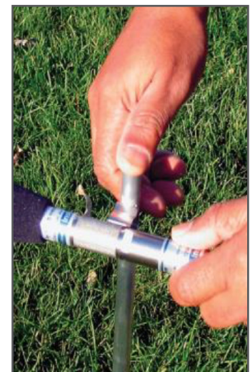
Figure 4. Installing the Microphone