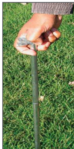
Figure 2. Soft Ground Installation