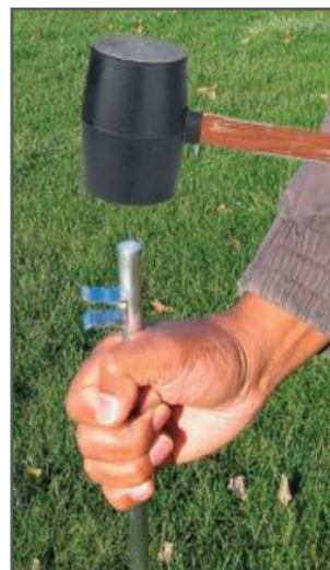
Figure 3. Hard Ground Installation