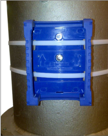
Micromate Protective Boot attached with tie wraps

When it is not possible or convenient to use screws to secure the Micromate in place, the protective boot can be held in place with large plastic tie wraps or metal straps. The slots in the bottom of the boot provide space for these straps while not interfering with the installation of the unit.