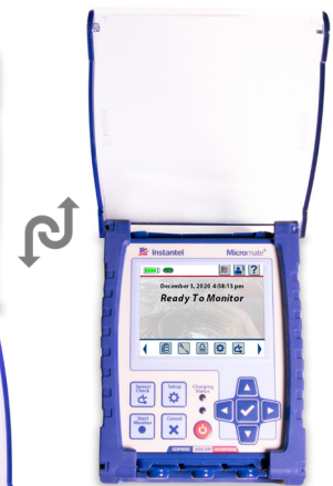
Hand-held cover opens up