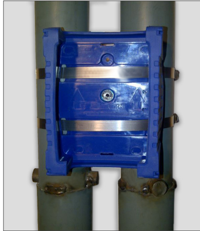
Micromate Protective Boot attached with metal straps