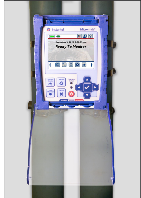
Accessing the installed Micromate