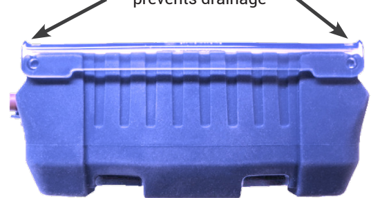
Durable silicon boot side view