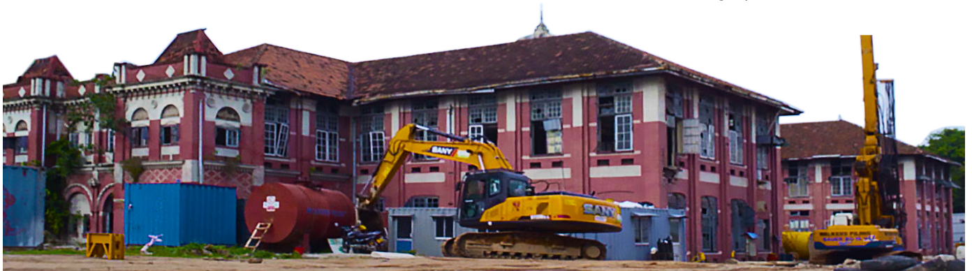
Piling Construction Around The Transworks House