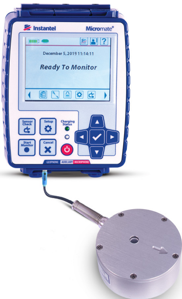
Micromate Seismic Monitor With Geophone

InstanTel's Micromate seismic monitor was chosen to measure ground vibrations according to the Amended Air Blast Over Pressure (ABOP) and Ground Vibration National Standard of Sri Lanka which is based upon the ISO 4866:1990 (and updated to the ISO 4866:2010) Standard. The characteristics of this building fall into Type 4 "Structures declared as archeologically preserved structures because of their sensitivity to vibration".