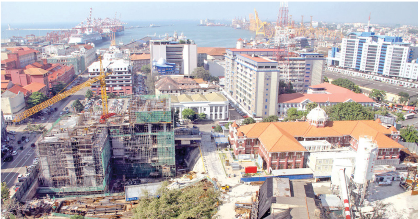
Construction work on the "The One" skyscraper on the left with the Transworks House on the right, City of Colombo, Sri Lanka.

This direct feedback was crucial in allowing the contractor to remain on schedule and make dynamic changes on the machinery's power, bore speed, and applied pressure to minimize vibration propagation and preserve the structural integrity of the historical Transworks House. By consistently monitoring the Transworks House during the pile driving, this phase of the project was successfully completed with no issues.