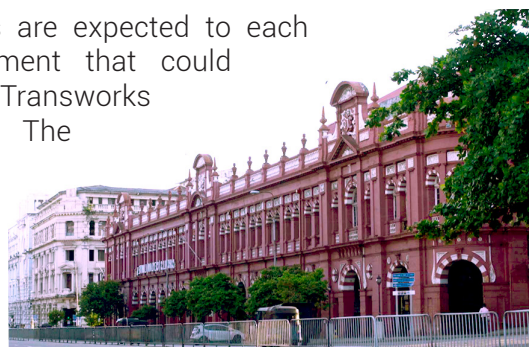
Street View Of The Transworks House

These three new skyscrapers are expected to each have an underground basement that could cause the land, on which the Transworks House is built, to collapse. The historic Transworks House was built using an old rubble technique and does not have the structural stability of modern steel frame buildings we see today.