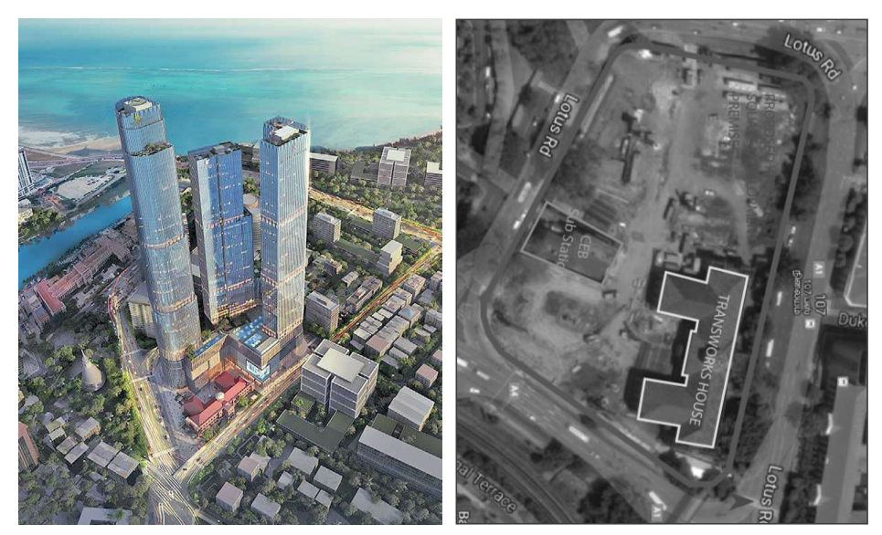
Left: An Urban Architect's Proposed Design Of "The One" Skyscraper Project. Right: The Outline Of The Transworks House To Be Preserved During Construction.

How A Vibration Monitoring System Protects a 100-Year-Old Building During "The One" Skyscraper Project