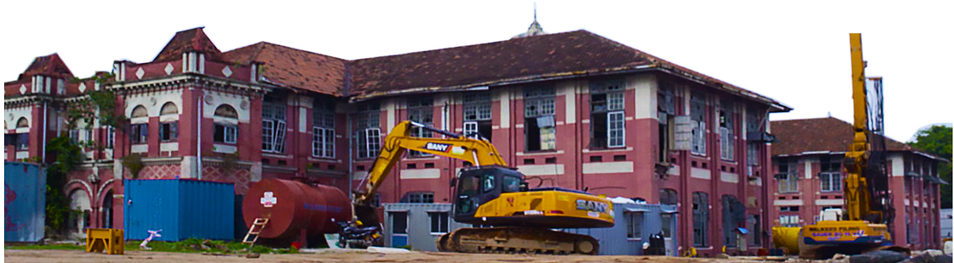
Piling Construction Around The Transworks House

Piling Layout Around the Transworks House