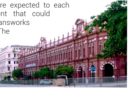
Street View Of The Transworks House

These three new skyscrapers are expected to each have an underground basement that could cause the land, on which the Transworks House is built, to collapse. The historic Transworks House was built using an old rubble technique and does not have the structural stability of modern steel frame buildings we see today.